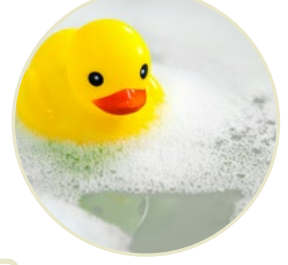
Have a bath