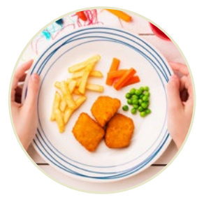
Eat my dinner